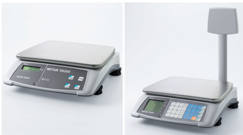
bRite Weigh Only